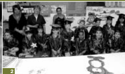
2 Class of 2004: TCDC's first kindergarten graduates.