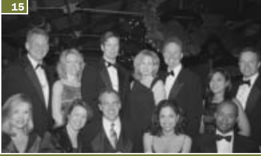
Guests enjoying the Mardi Gras at Liberty fundraising gala in March.

TCDC was the recipient of more than 400 donated books that were collected by 5th graders from the Edward H. Bryan School, Cresskill. Thanks to the children's generosity, the TCDC library now boasts a wide variety of reading materials for its little patrons.